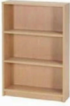
MS501 MINI BOOKSHELF 600mm (W) x 190mm (D) x 900mm (H)