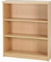
MS525 ADJUSTABLE SHELVING 800mm (W) x 290mm (D) x 1000mm (H)