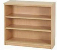
MS526 ADJUSTABLE SHELVING 800mm (W) x 290mm (D) x 730mm (H)